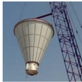
Haleeb Foods Ltd., Pakistan